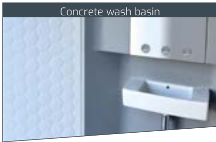
Concrete wash basin