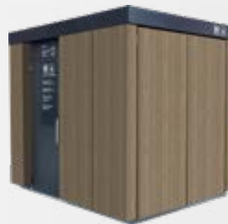
Vertical composite wood cladding