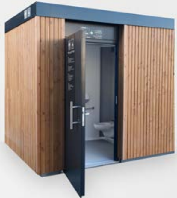
HEXABOX natural wood cladding