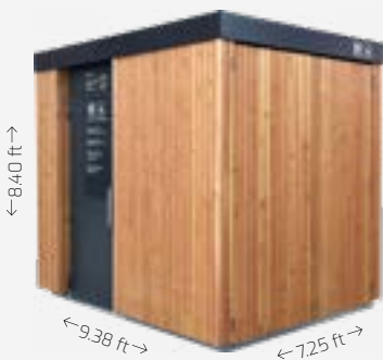
Vertical natural wood cladding