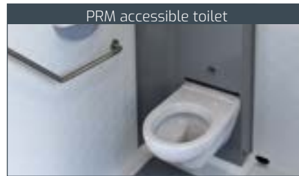
PRM accessible toilet