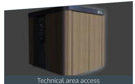
Technical area access