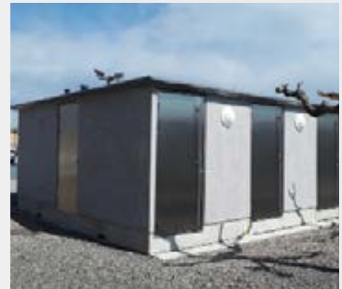
Modul'San 6-cabin model Polished gray concrete finish