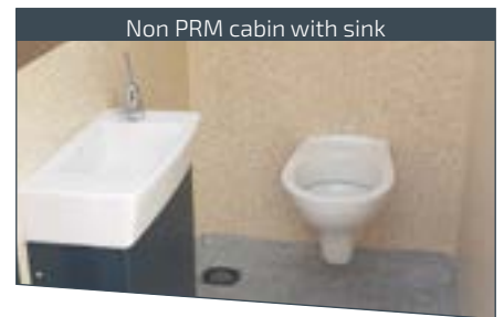
Non PRM cabin with sink