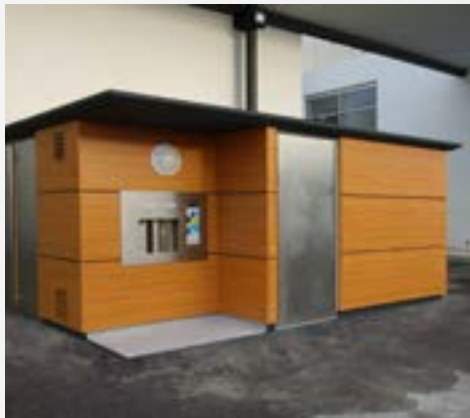
Modul'San 3-cabin model Composite cladding