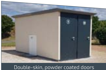
Double-skin, powder coated doors