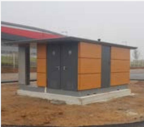
Modul'San 4-cabin model Composite wood cladding with laundry area