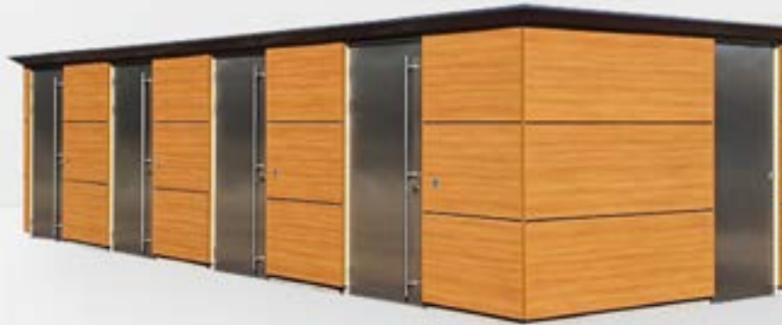
Modul'San 8 cabins, composite wood cladding