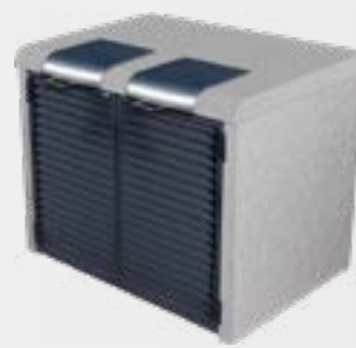
Concrete, gray tinted textured finish