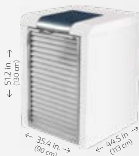
Concrete, polished white finish