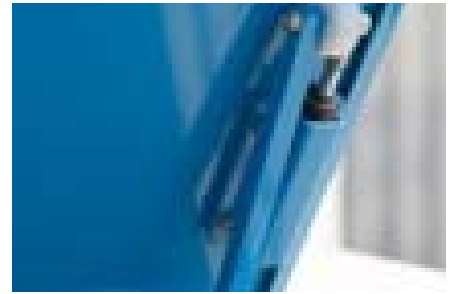
Hatch equipped with a damper