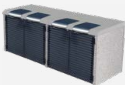
Concrete, gray sandblasted finish