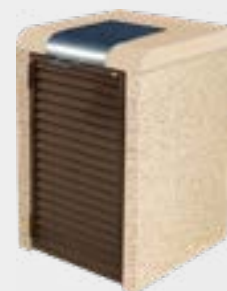
Concrete, beige sandblasted finish

Designation: Outdoor Number of bins: 1 to 4 Weight: from 2,204 lbs. (1 metric ton)