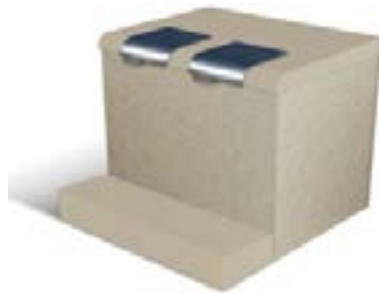
Step in front of shelter