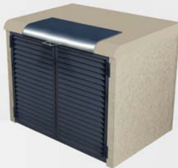
Lucia Concrete, beige tinted textured finish