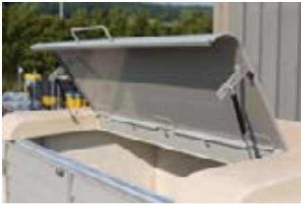
Large volume hatch