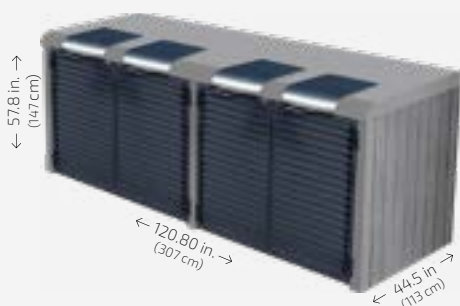
Concrete, gray vertical wood slat pattern finish